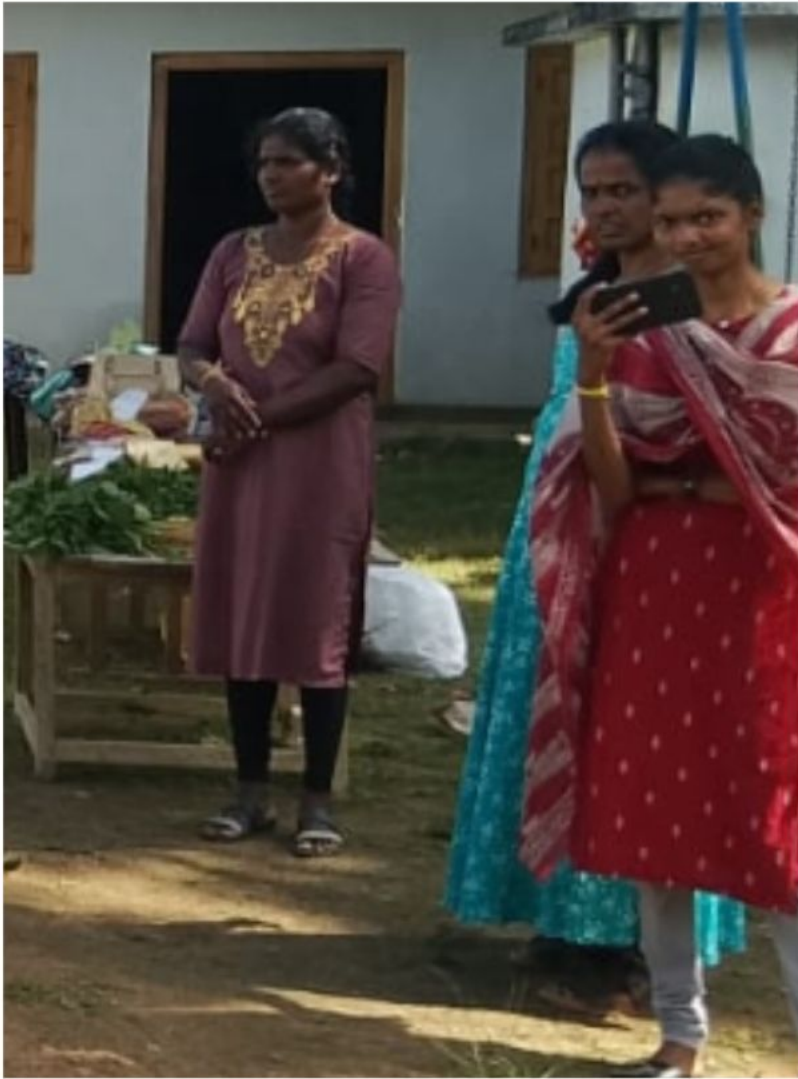
Kilinochi-Menuka & Devika POs